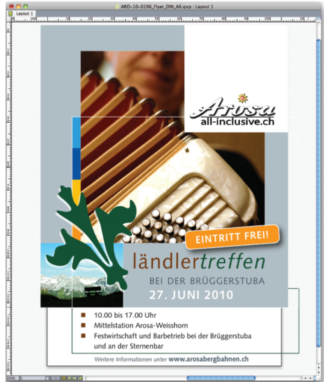
The new cross-media workflow ensures that both print and iPhone publications comply with corporate branding guidelines.